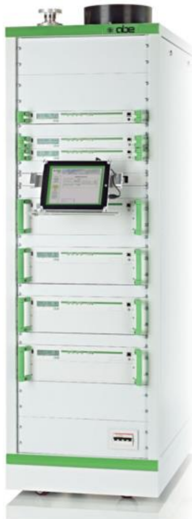
3.5kW Digital TV Transmitter High efficiency – Ducted Cooling version